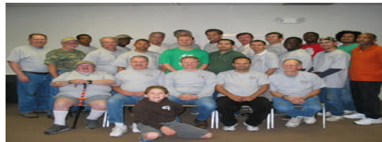
Welcome Eastern Coast Deaf Men Retreat